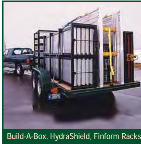
Build-A-Box, HydraShield, Finform Racks