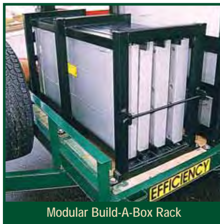
Modular Build-A-Box Rack